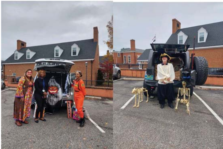
Child Support organized the 2022 Agency Trunk or Treat event, costumes and cars looked great, a good time was had by all!