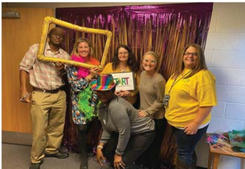
The 2022 Sobriety Treatment And Recovery Team Retreat at Chesapeake College