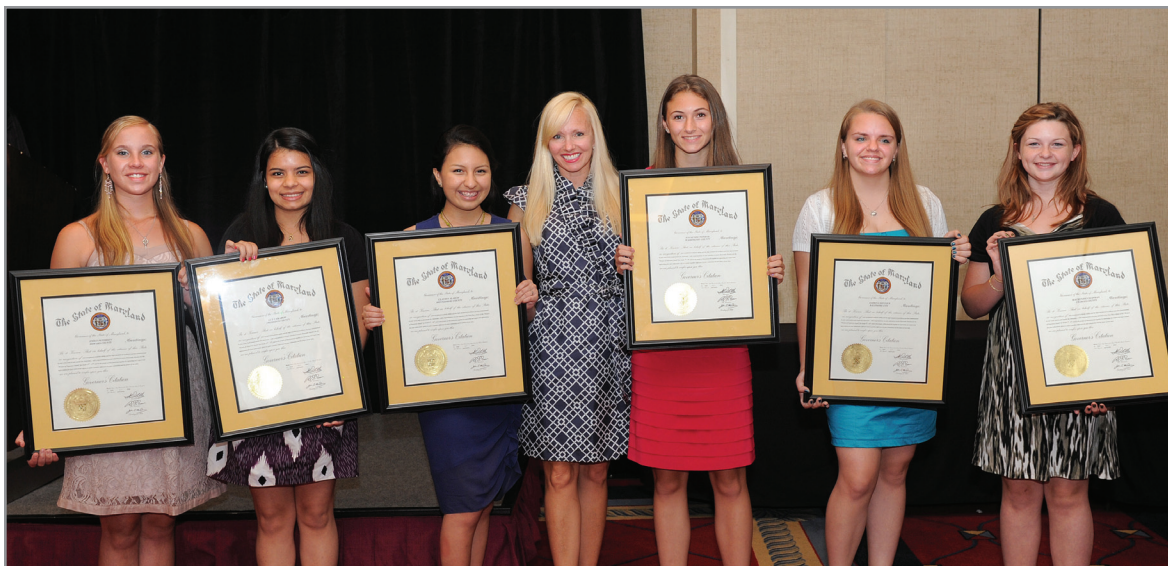
Last year Awardees 2012