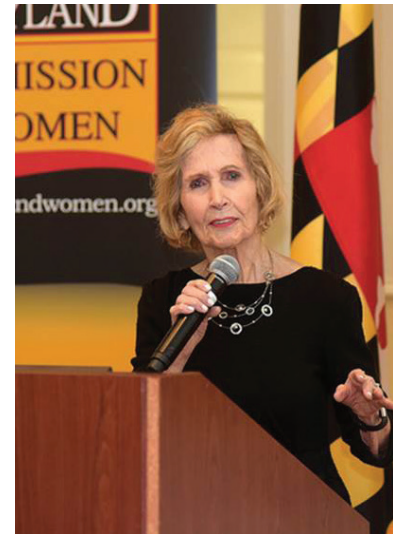
The Honorable Connie Morella