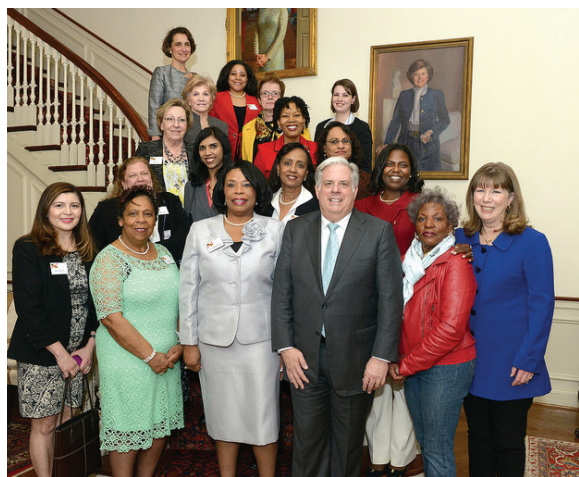
Members of the Commission for Women with Governor Larry Hogan